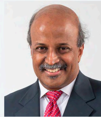
Paul Anantharajah TAMBYAH

Newscaster, Bloomberg Opinion columnist covering Asia politics with a special focus on China