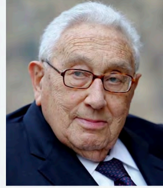
Henry KISSINGER (TBC)

Politician, diplomat, and geopolitical consultant, Former United States Secretary of State and National Security Advisor, Chairman of Kissinger Associates, Inc.