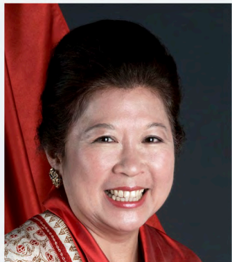
Mari Elka PANGESTU

Founder and Managing Partner at Summa Equity