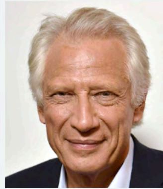
Dominique de VILLEPIN

President, National University of Singapore