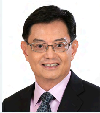
HENG Swee Keat