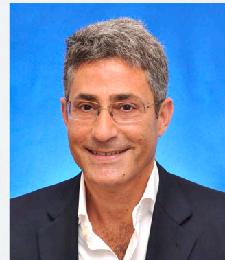
Assaad Wajdi RAZZOUK

Former World Bank Managing Director of Development Policy and Partnerships, Former Minister of Trade and Minister of Tourism & Creative Economy, Indonesia