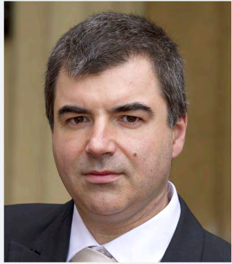
Sir Konstantin 'Kostya' NOVOSELOV